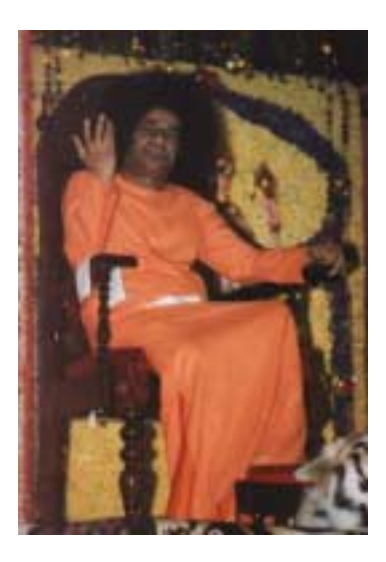
<u>Sixth</u> is the Shakthipaatha Mudhra . It is the activation of a devotee's spiritual energy by Baba.

<u>Fifth</u> is the Thirodhana Mudhra . It is the gesture of circling the right palm in an outward direction driving away impurities or negativities in the surroundings.